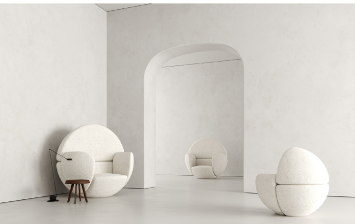
The playful shape of the lounge chair beckons users with the promise of a comfortable repose