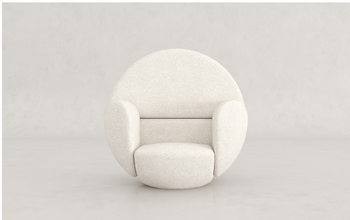
The curvy shape of the chair exudes a light aura around it