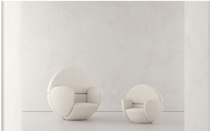
The high armrests and backrest of the chair cradles the seater like a baby